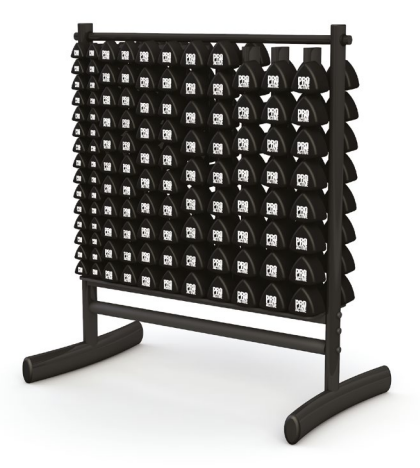
PAMHR02-11 rack shown

For rack information see page 16 and 17.